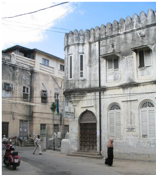
Palace in Stone Town, Zanzibar with carved door, wooden window shutters and castellated battlements