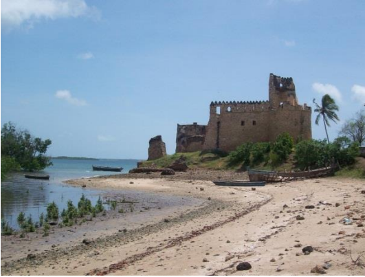
The Gereza on Kilwa Kisiwani, Tanzania, was a fort built by Omani Arabs in about 1800. It incorporates the walls of a smaller Portuguese fort built in 1505