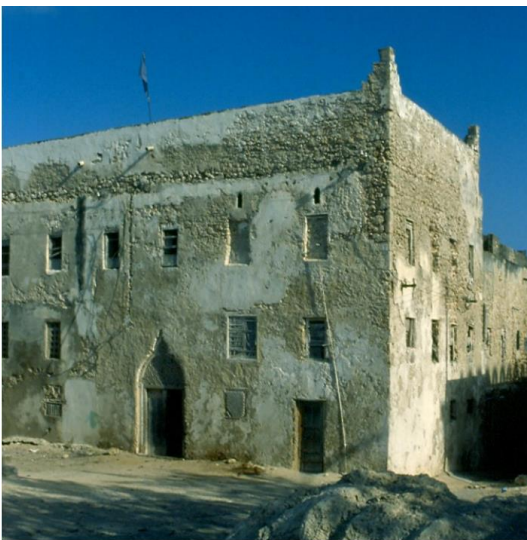
House with intricate carved door, Shangani, Mogadishu, Somalia. The carved door is displayed in detail in the carved doors section.