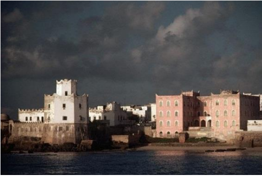
View towards fort, palace and old waterfront buildings of Mogadishu, Somalia, in better days (1980).