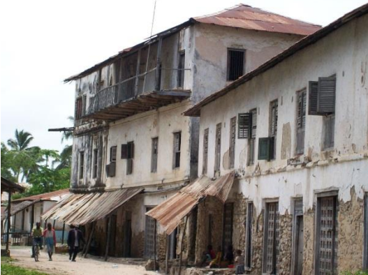
Mid-19 th century Omani residences in Kilwa Kivinje, Tanzania, with original carved doors, balconies and window shutters

An introduction to East Africa's Shirazi and Omani monuments