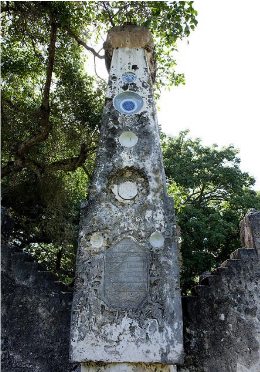
Pillar with Chinese porcelain bowls, Kunduchi, Tanzania.

Some ancient Swahili settlements have distinctive graveyards which are unique to the East African coast. The graveyards are usually situated in a grove of Baobab trees. Their gravestones are ornately carved from coral ragstone and some bear large, obelisk-like pillars. These 'pillar tombs' appear to have their roots in pre-Islamic fertility rites: the twelfth-century Iberian geographer Al-Idrisi reported the worship of fish oil anointed megaliths in Somalia. Some surviving tombs date back to the 14 th and 15 th century when the Swahili-Shirazi civilization was at its height and the tradition continued to the second half of the 19 th century. The curious pillar tombs can be found at several abandoned sites, especially at Kaole, Kunduchi, Tongoni (Tanzania) and Gedi (Kenya), but even in the suburbs of Dar es Salaam - at Msasani bay - there is a seldom visited graveyard where several pillars stand erect.