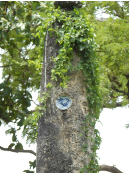
Pillar with Chinese porcelain bowl, Msasani, Dar Es Salaam, Tanzania

The pillars can be square or octagonal and at Hamisi ruins on Pemba Island one particularly large tomb is surmounted by a ten-sided pillar with floral motif. The pillars often have several circular depressions that originally held blue-and-white Chinese porcelain bowls. Their presence is a monsoon-driven dhow trading network. Most porcelain bowls were stolen; Kunduchi is one of the few sites where the bowls are still in their original setting. There's one porcelain bowl at the Dar es Salaam site too. Two porcelain bowls from Kaole are in Dar's National Museum. Circular depressions that held porcelain bowls can also be found at ruins of medieval mosques - usually nearby the tombs - on either side of some well-preserved mihrabs (prayer niches that indicate the direction of Mecca). Noteworthy is a tomb in Tongoni that once bore an imported glazed tile with a Persian inscription, the only such example found in East Africa. This tile was also 'lost'.