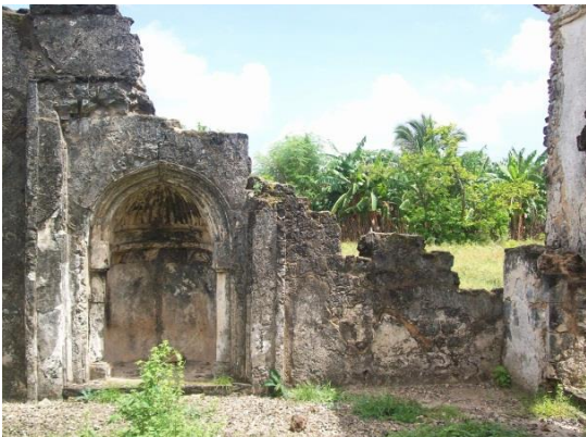
Mihrab of Great Mosque (15 th century), Kilwa Kisiwani