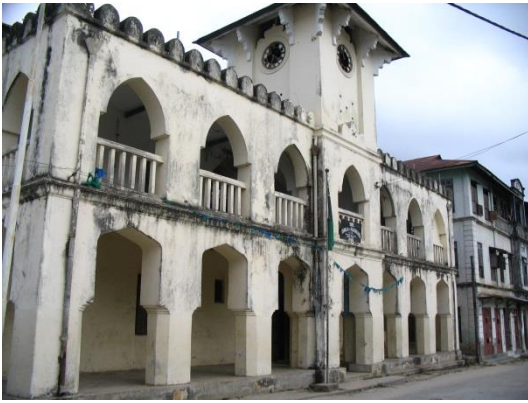
Omani court house with colonial era clock tower, Chake Chake, Pemba, Tanzania. Its impressive carved door is displayed in the carved doors section.