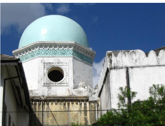
High court of justice, Stone Town, Zanzibar

Often overlooked by visitors to East Africa, the coastal areas of southern Somalia, Kenya, Tanzania and northern Mozambique boast several ruined and extant historical towns of significant cultural importance. Although some receive an increasing number of visitors - especially Stone Town in Zanzibar and Lamu in Kenya - most sites seldom see a single soul. Places like Kilwa and Pemba in Tanzania are notable for their remote and isolated location, whilst the city of Mogadishu has been a no go area for years due to the ongoing Somali civil war. This brief introduction to East Africa's Shirazi and Omani structures intends to make a broader public familiar with the presence of world class, African monuments in a part of the continent for which it's early history is commonly only associated with colonial influence.