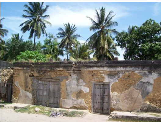
Residence in Kilwa Kivinje, Tanzania