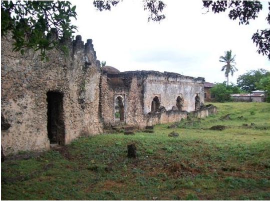
Great Mosque, Kilwa Kisiwani. 13 th (right part) and 14 th century (left part). In medieval times Kilwa ('Quiloa' on old maps) was East Africa's most important settlement