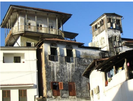
'Skyscrapers', Stone Town, Zanzibar

The longevity of Swahili doors, often outlasting the houses whose entrances they once guarded and being reset in new homes - is the result of the type of wood used. Many doors are made out of local hardwood such as the bread fruit tree ( Mninga ), but also teak and sesame imported from India.