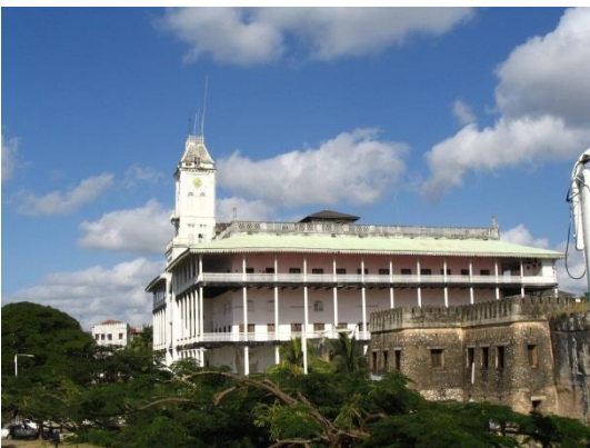
The Omani Fort in Stone Town, Zanzibar, was completed in 1701 (right). Its walls incorporate several Portuguese remnants: foundations of a chapel, a merchants house and earlier fortifications. To the left of it is the Beit al-Ajab, completed in 1883. It was the tallest building in East Africa at the time.

intertwine, effectively making the tomb part of the tree.