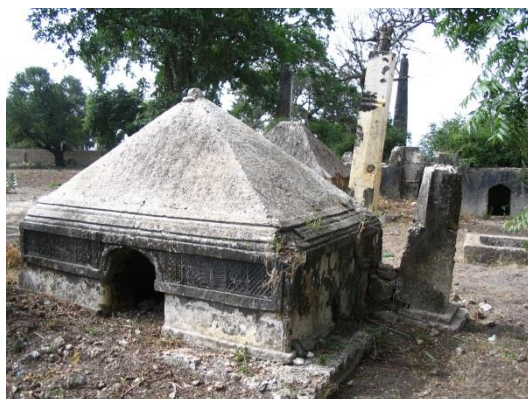
Graveyard dating back to the 17 th century, Msasani, Dar Es Salaam, Tanzania

accessed by narrow alleyways, keeping the heat and glare at bay.