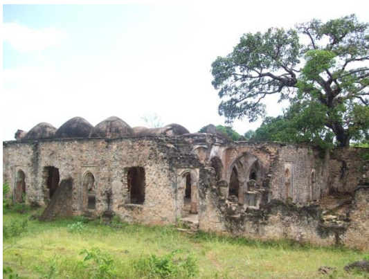
Great Mosque from the south west, Kilwa Kisiwani, with recently restored domes

sprung up between 13 th and 15 th century, most of them in modern day Tanzania.